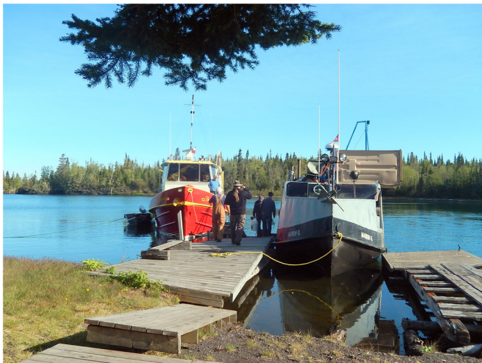
Left, volunteers unload supplies and equipment at the Porphyry dock in preparation for work party maintenance on the Porphyry grounds and facility. Above right, an aerial view of the Porphyry Light Station and surrounding grounds under the stewardship of CLLS. Below right, CLLS volunteers taking a well-deserved break at #10 Light.

Lighthouse Fundraiser... The Canadian Lighthouses of Lake Superior will hold the first annual Lighthouse Fundraising Dinner on May 9 th at the Prince Arthur Hotel (see ad on last page of this Bulletin ). Tickets will be available at the Prince Arthur Hotel on April 15 or can be purchased online at https://thunderbay.booknorthwesternontario.com/English/Tk_Select_Ticket_single.asp?SelTicket=Light113&afl_ID=fundraiser