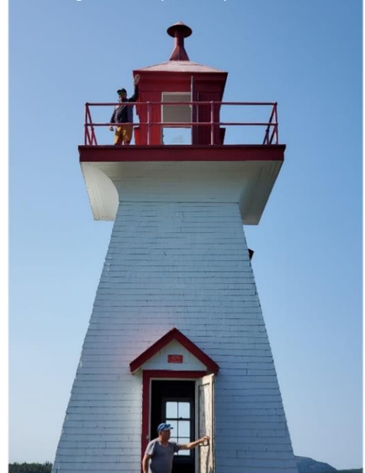
No 10 Lighthouse opened up for access work

Managing Director, Canadian Lighthouses of Lake Superior, www.clls.ca clls.managing.director@gmail.com