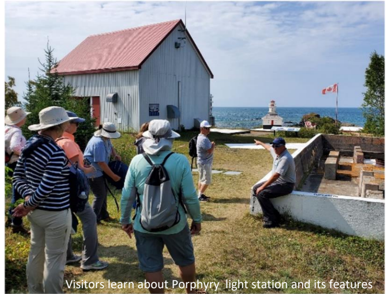
Visitors learn about Porphyry light station and its features

This summer at the Porphyry lighthouse it was bustling with Yacht Club activities and support. The club offers free access to the lighthouse for all members, and by mid-August this year, 200 members and friends arrived by boat, showing an increase of sixty people compared to the previous year. The SUNORA event held their awards night on the island after exploring the north shore for a week. It's always inspiring to hear stories and witness newcomers discovering the north shore with the guidance of experienced boaters.