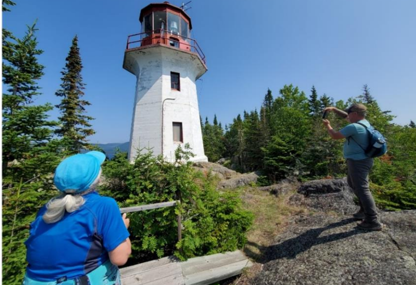
People visit to see the Trowbridge Lighthouse Tower.

In other lighthouse news, the Trowbridge Light 100-year celebrations were successful with many visitors in attendance. A highlight of the season was the Department of Fisheries and Oceans, Canada repairing 80 out of 100 steps to the light tower. Additionally, a small dock was installed at the No.10 light tower for access, and plans are in place to add a mooring ball next year. The No.10 (Shaganash) Light has long been a stopover for kayakers journeying through the island archipelago.