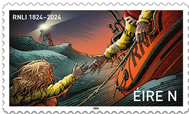
RNLI 200years Royal National Lifeboat Institution